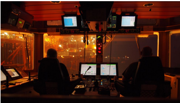
Figure 1. Example of a setting to design for in the offshore industry: The ship's bridge of an offshore service vessel discharging cargo at an oil rig.

using designers, they also see that the nature of the design assignments has changed. Previously, if designers were engaged they were mostly hired late in the process to “style” individual equipment, while now designers are more often involved earlier in the process and in projects with a wider scope: even the design of whole vessels and entire ship bridges. Further, in the last ten years some Norwegian design consultancies have started promoting their services more actively towards the offshore industry, and some Norwegian providers of maritime and offshore products and services have started employing in-house designers. The designers interviewed in the study presented here work at such companies.