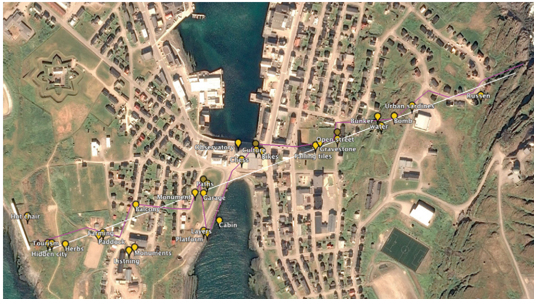
FIGURE 1 Transect walk, Vardø, 26 January 2014. The digital map layer exported from MAPPa can be displayed and post-processed using Google Earth or other geobrowsers.

First, we investigated the device of the transect walk itself and its contexts of use. With prior familiarity with Arctic urban and landscape settings and research, as well as experience in using related urban mapping tools in teaching and research (e.g. van Schaick & van der Spek, 2008; Morrison & Aspen, 2013), the architect-urbanist researcher on our team arrived at the technique of first studying aerial images and maps of the settings in question. Central to this method was the choice of working across urban structures in order to capture the largest variety and avoid pre-configured hierarchies of space (e.g. Nielsen, 2001).