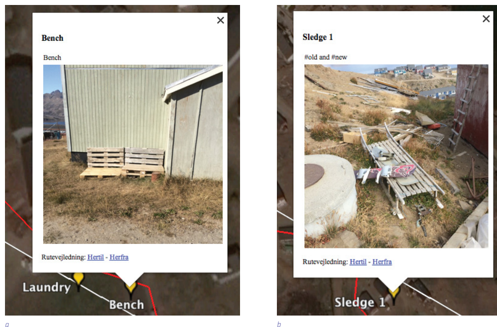
FIGURE 3 a). Transect walk, Tasiilaq, 28 August 2014. Ephemeral dimensions of space are captured through the transect walk, such as the improvised bench made of shipping pallets. b). Evidence of hunting culture is omnipresent in the urban landscape, along with expressions of contemporary lifestyles. Thematic hashtags are used across mappings.