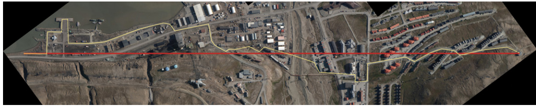
FIGURE 4 Transect walk, Longyearbyen May 26, 2016. Excerpt from the collaborative record of the transect walk reflecting on the experience of crossing the river).