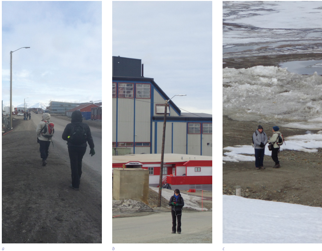
FIGURE 5 Svalbard transect walk. The group of researchers dispersed along the transect line.