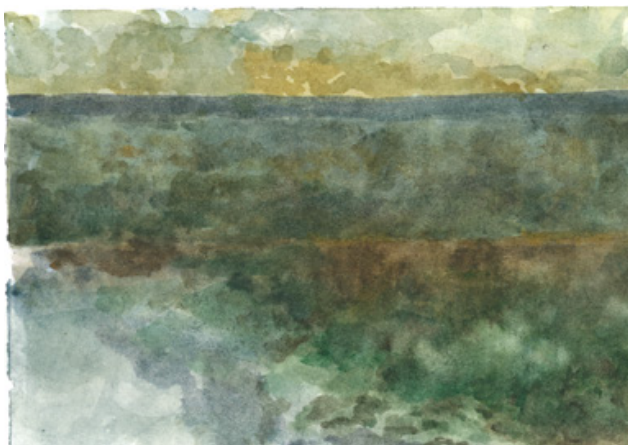
RE-ENACTED GARDEN MEMORIES (EXTRACT) WATERCOLOR DRAWINGS