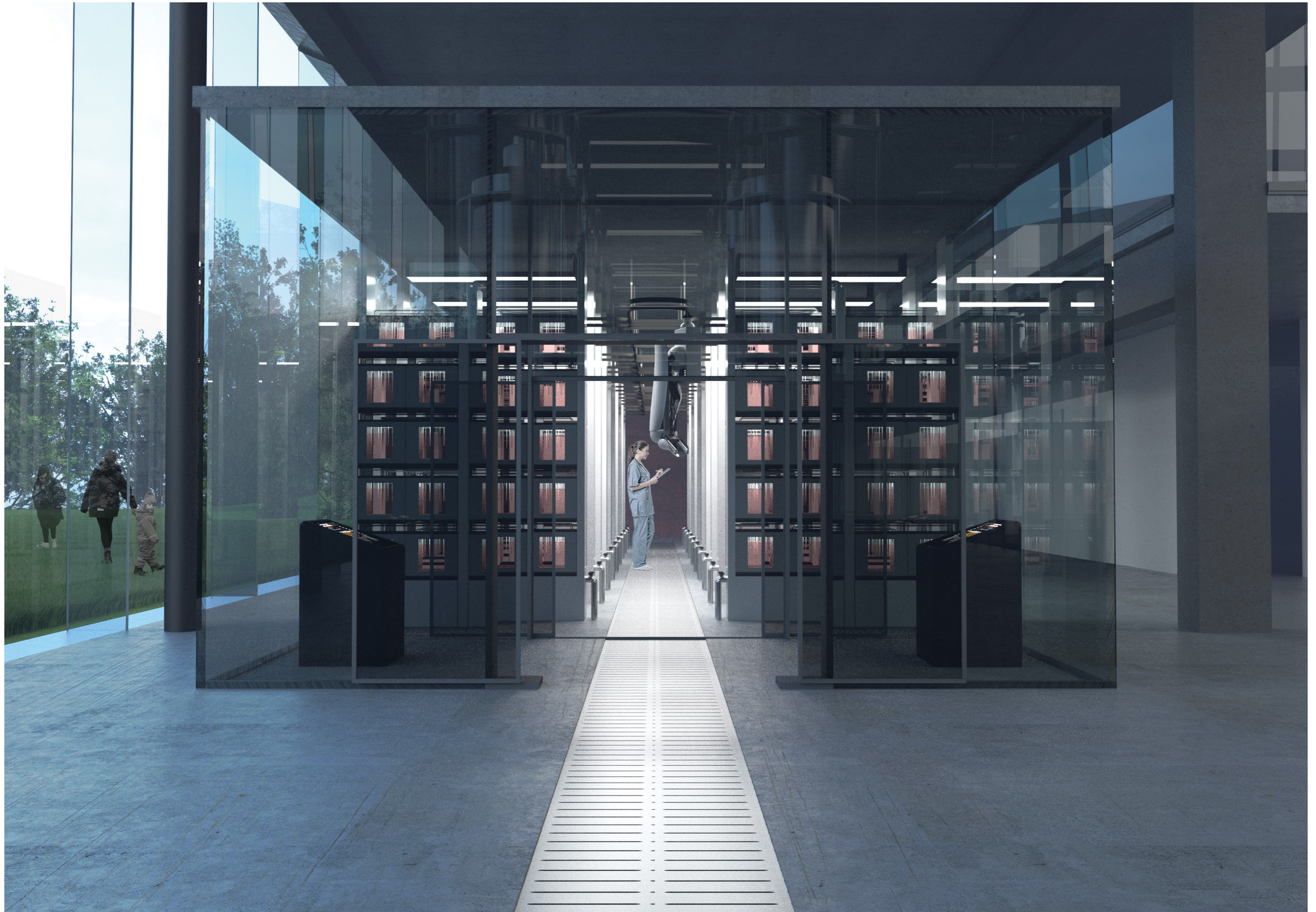
PRODUCTION HALL WITH CELL FIBRE GROWTH CHAMBER