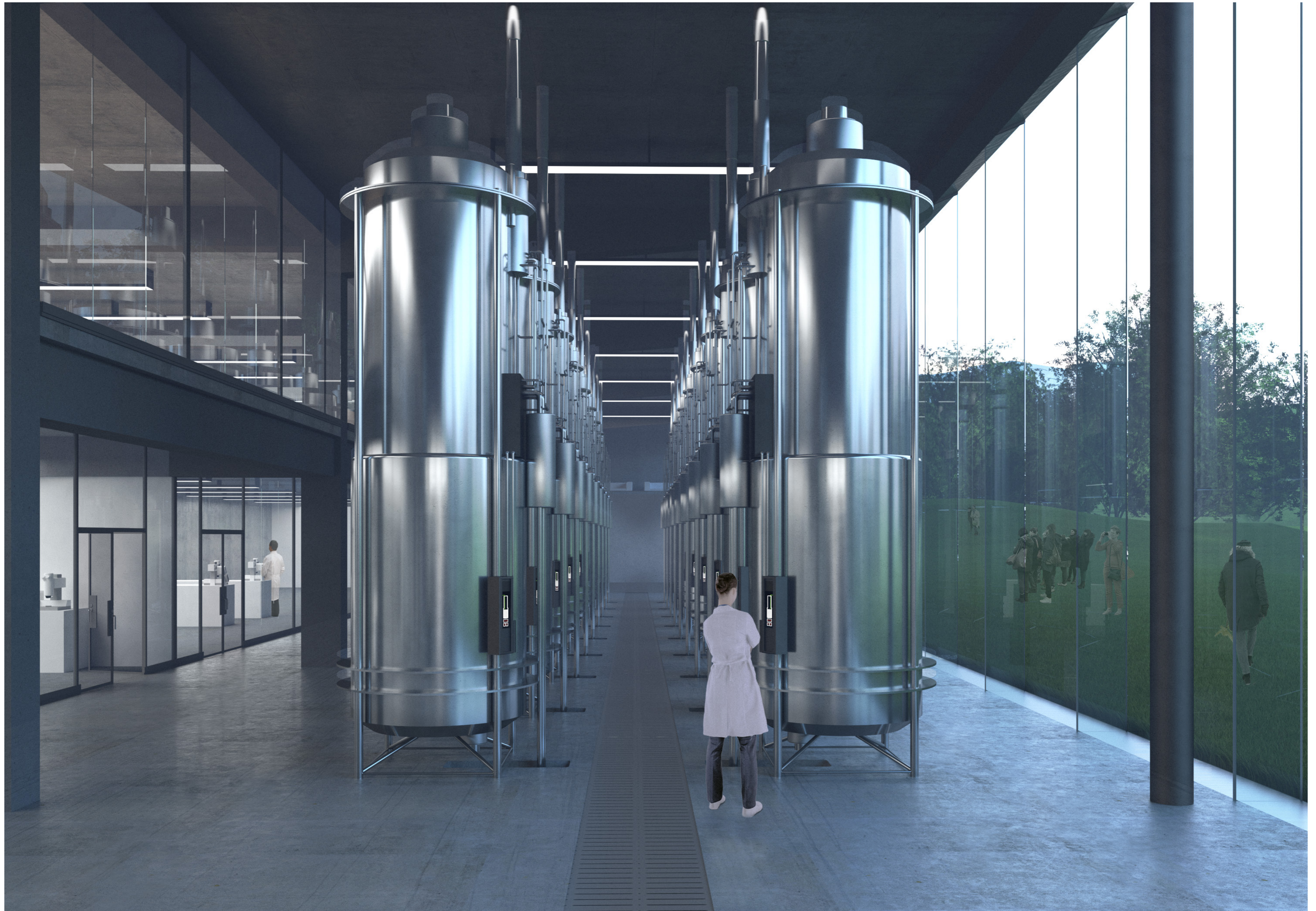
PRODUCTION HALL WITH BIOREACTORS FOR CELL CULTIVATION