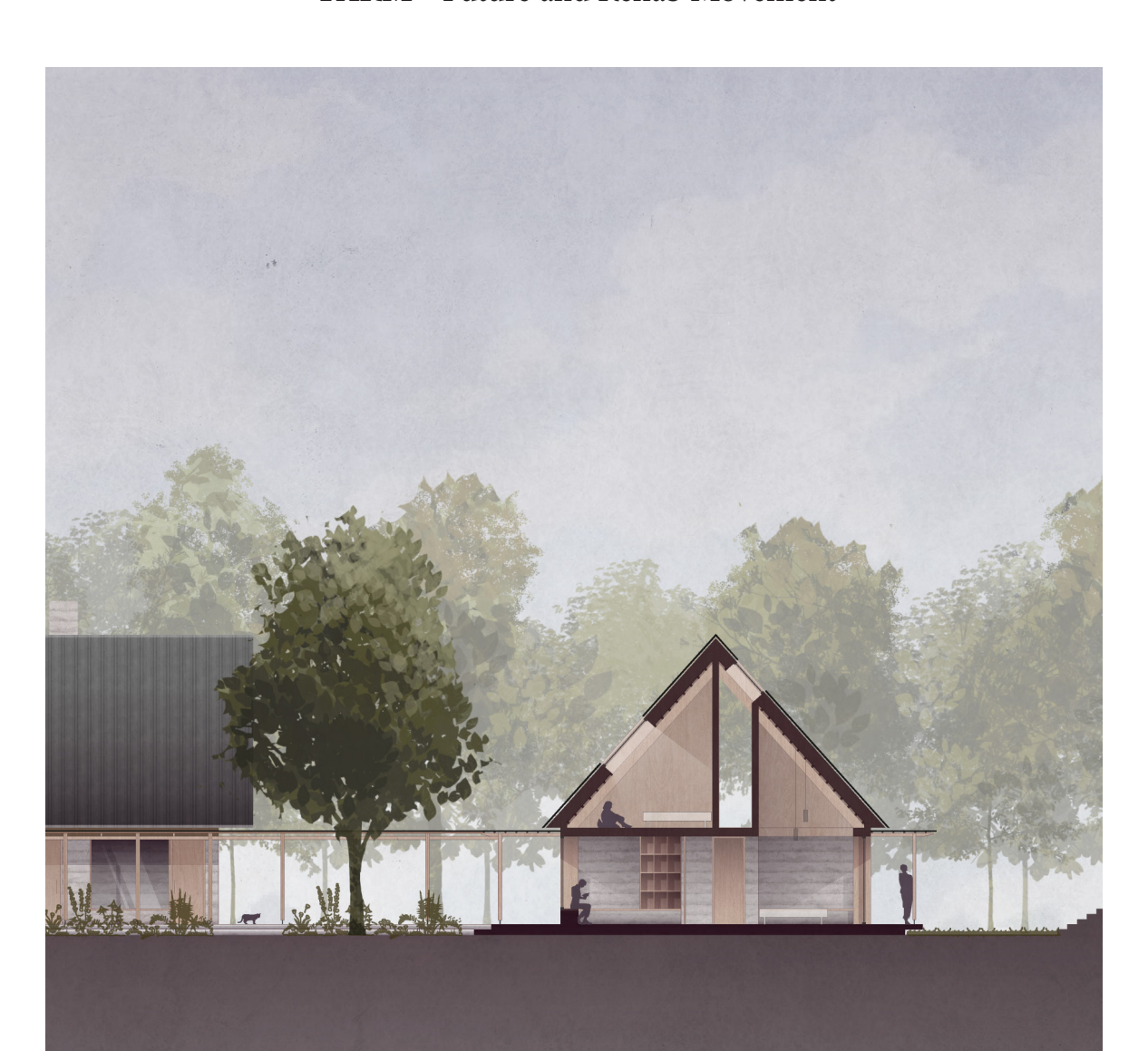
FARM - Future and Rehab Movement