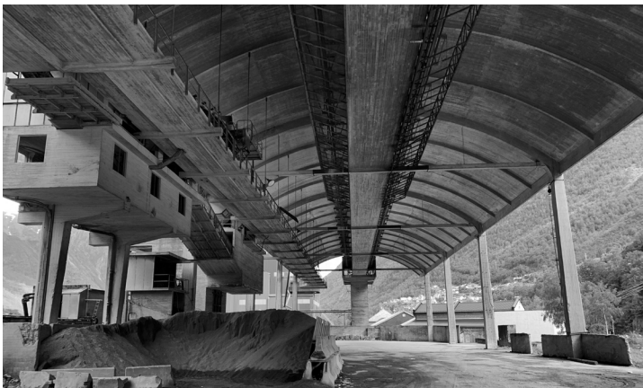
Fig. 6: The Shell Roof as of today (August 2020)

Each of the fields above emphasize different views and interests. Dealing with transformation of industrial heritage architecture, the solution might be to set a hierarchy of values. Odda Smelting Works as a whole bears multiple important values, both historical, social and technical, as well as aesthetical. The Shell Roof is most prominent for its' technical and aesthetical qualities. Those are the ones I seek to preserve.