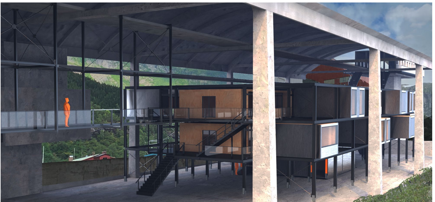
Fig. 8: Project Proposal

Bottom-up approach: allowing Odda to take ownership of the place module by module, inviting inhabitants to incrementally occupy its' multiple functions that are provided by structural flexibility, thus making parts of the structure more accessible.