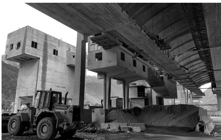
Fig. 5: Some of the adjacent fixtures and material transport belt (above). August 2020