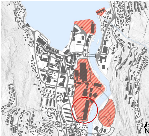
Fig. 1: Former Odda Smelting Works site and adjacent industrial areas (The Shell Roof circled)

OSW has been active in the period from 1924 until 2003, when the company went bankrupt and production of chemical compounds, primarily cyanamide and carbide, was laid off. With the disappearance of this cornerstone company , the town of Odda has suffered problems with a population decrease as well as an overwhelming abundance of obsolete building mass, making up for approximately 40 000 square meters of industrial buildings. There have been successful municipal efforts to revitalize and reuse some parts of the factory (known as "Oddaprosessen"), but the majority of the industry-specific building mass has still not adopted any new functions.