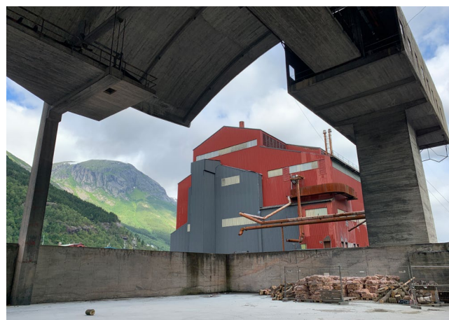
Fig. 6: The Northern end of the roof, tightening tower for material transport (right). Ovn 3 (Carbide Kiln 3) in the background. August 2020