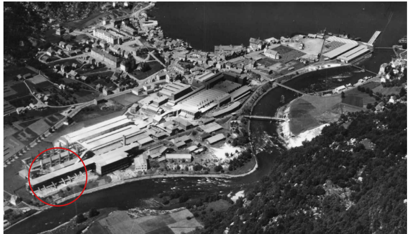
Fig. 2: Aerial photo of the Smelting Works dated between 1932-1938