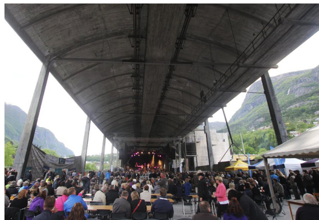
Fig. 4: Example of a cultural arrangement taking place under the shell roof in 2014.