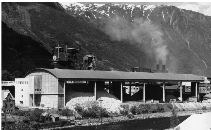
Fig. 3: The Shell Roof as seen from Hjølotippen, 1959