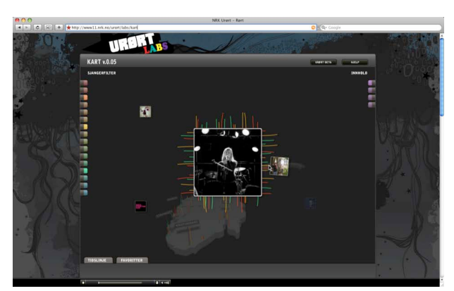
Figure 6: In playback mode, straws grow out from the image of the artist the user is listening to. These are recommended tunes based on the current tune and the social listening patterns of other people.

are important for many of these artists and their audience. At the same time, social media services have the ability to make physical location insignificant by allowing mediating artefacts to travel and activities to take place across the globe regardless of physical location. Media content and related mediated activities may therefore be described as taking place across real and virtual spaces. In Urørt, artists and their music are connected to a real geographical place in Norway, at the same time as their music is available in an online environment independent of the artists' belonging to a physical place.