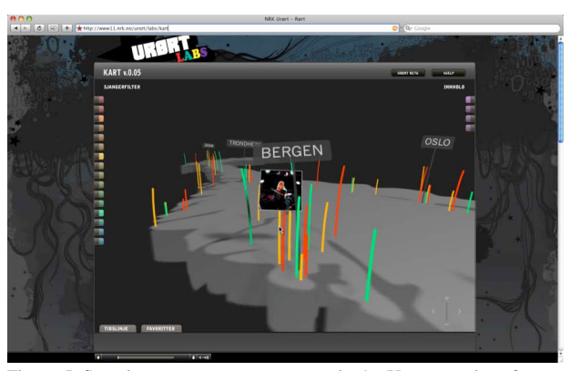
Figure 5: Swaying straws represent tunes in the Urørt map interface. By hovering the mouse over or nearby a straw, a short excerpt from the tune plays, and a small image of the artist appears on the tip of the straw, providing a quick way of browsing music in relation to the geographical context.

The design process included a variety of techniques, including user workshops, online user evaluation of ideas, storyboard sketching and digital sketching. A voice-over was produced and served as a starting point for composing the final prototype, a video composed in Adobe After Effects.