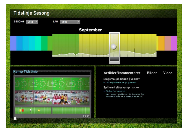
Figure 2: The Timeline application presents a timeline that shows the whole season for a chosen football team, in which football matches as well as the level of meta-activity are indicated visually. An additional panel in the lower left corner presents the timeline of a selected match in detail, with comments, schematic top-view of the field, stills and video. The panel in the lower right corner presents more general news, articles, comments and discussions.

exploration, and is therefore helpful for communicating relations, for example along a one-directional continuum. In football, the continuum of time is especially important, as events such as a score happen at the micro scale of time, while the resulting consequences and mediated discussions are long-lasting.