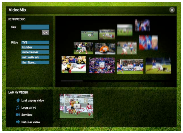
Figure 3: The VideoMix interface allows users to find videos by searching and filtering. The result is presented visually in a three-dimensional environment, where the most popular videos line up in the front. It is possible to see more videos by navigating sideways. As the search is adjusted, some videos drop out, while new ones arrive. It is possible to make and remix video compositions by dragging existing videos down to the lower part of the screen.

The Magnet application (Figure 4) presented here provides a way of representing, exploring and navigating relations in an online social football community. The interface shows visual representations of friends, football teams, matches and events, and the internal relations between them. These relations are often a