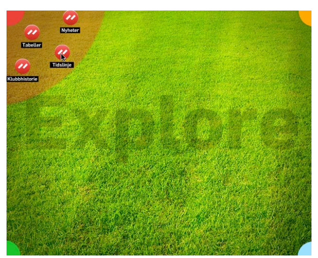
Figure 1: In the Pitch interface, four application containers are located in the four corners of the screen. By pointing to one of the corners, relevant applications pop out. Here, the 'explore' applications are presented in the upper left corner.

The pitch, or the playing field, is the physical location where football takes place. Acting as a giant scene, the audience gather around it, in a spectacular social event that includes cultural artefacts such as supporter clothing, banners, and now mobile phones.