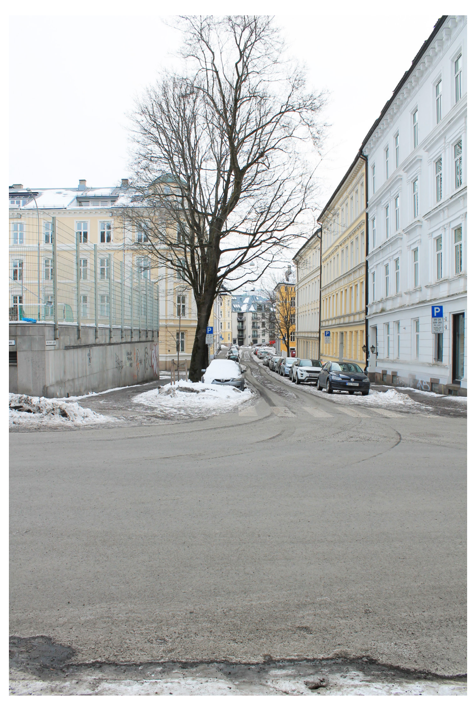
Standingin Reichweins gate looking south-east.