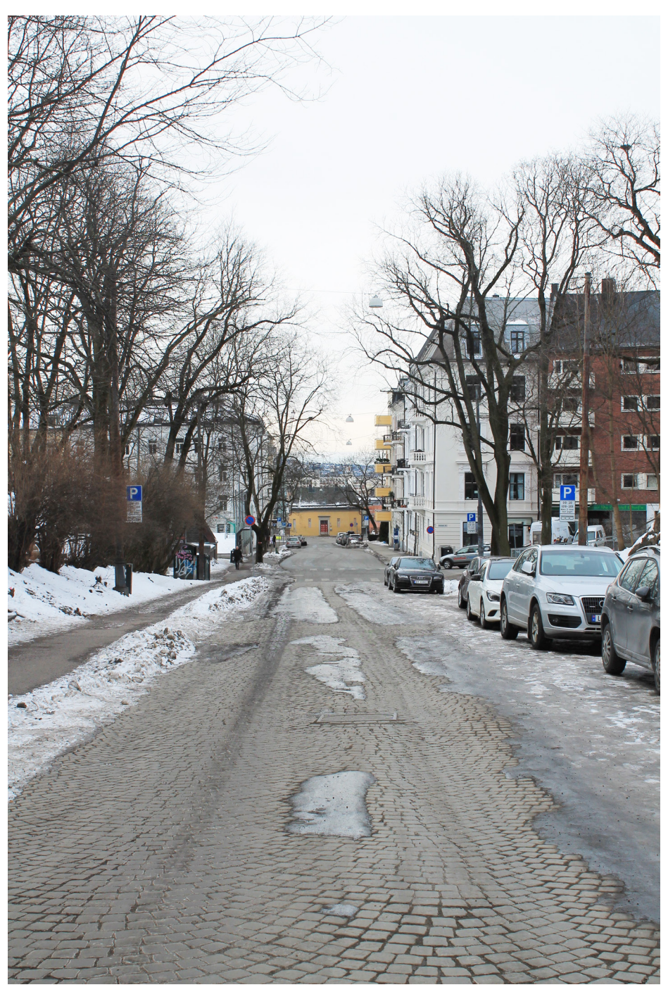
{\it Standing~in} Parkveien looking south-west. Site on the left hand side.