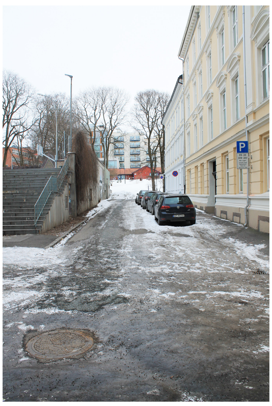
Standing in Reichweins gate, looking down Børvens Løkke with Ankerhagen Park in the end of the street.