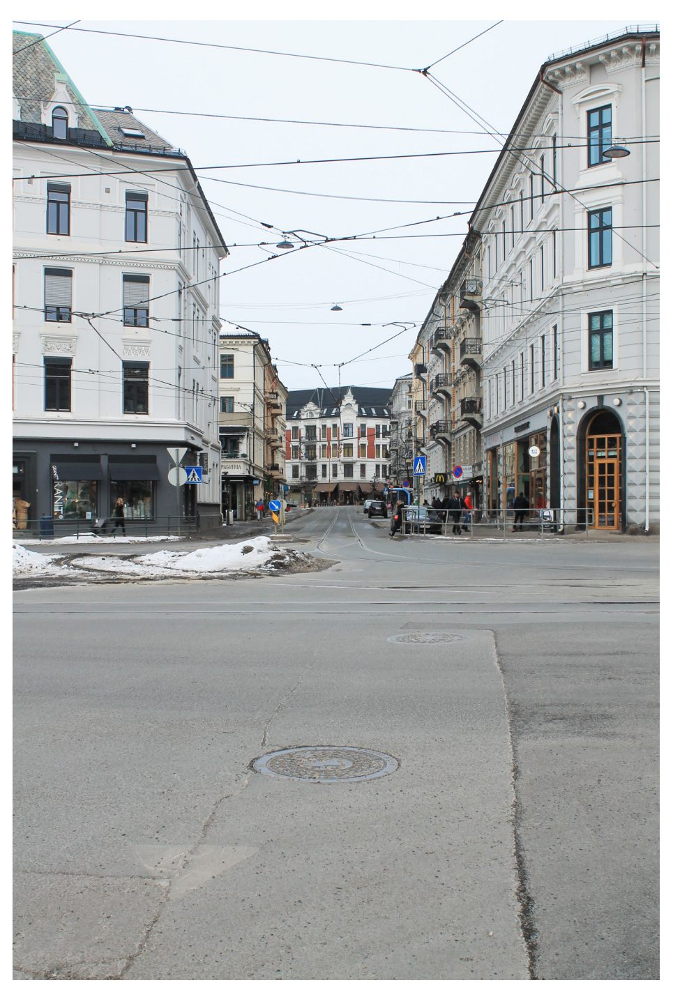
Standing at Solli Plass looking down Frognerveien, the corresponding street fro Observatoriegata, the opposite end of the axis to the northern corner.