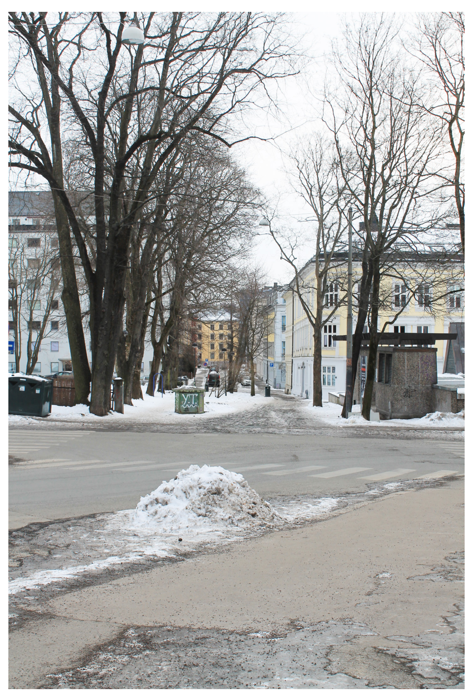
Standing in Observatoriegata, looking south east along the pedesterian street going past the park and the site on the right hand side.