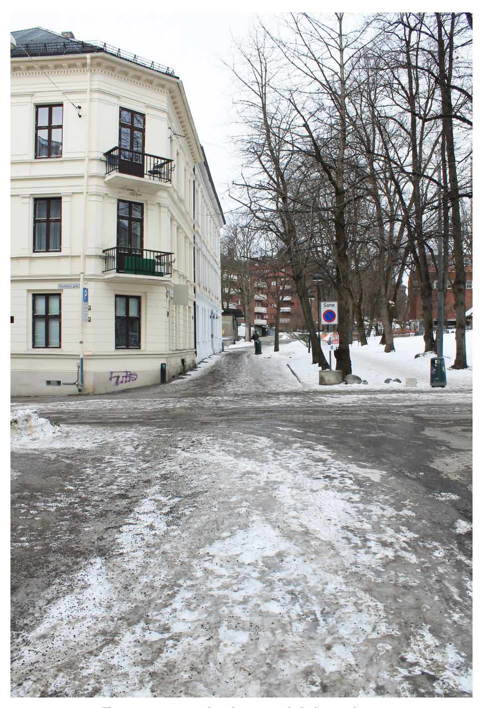
The same situation seen from the opposit side, looking north west.