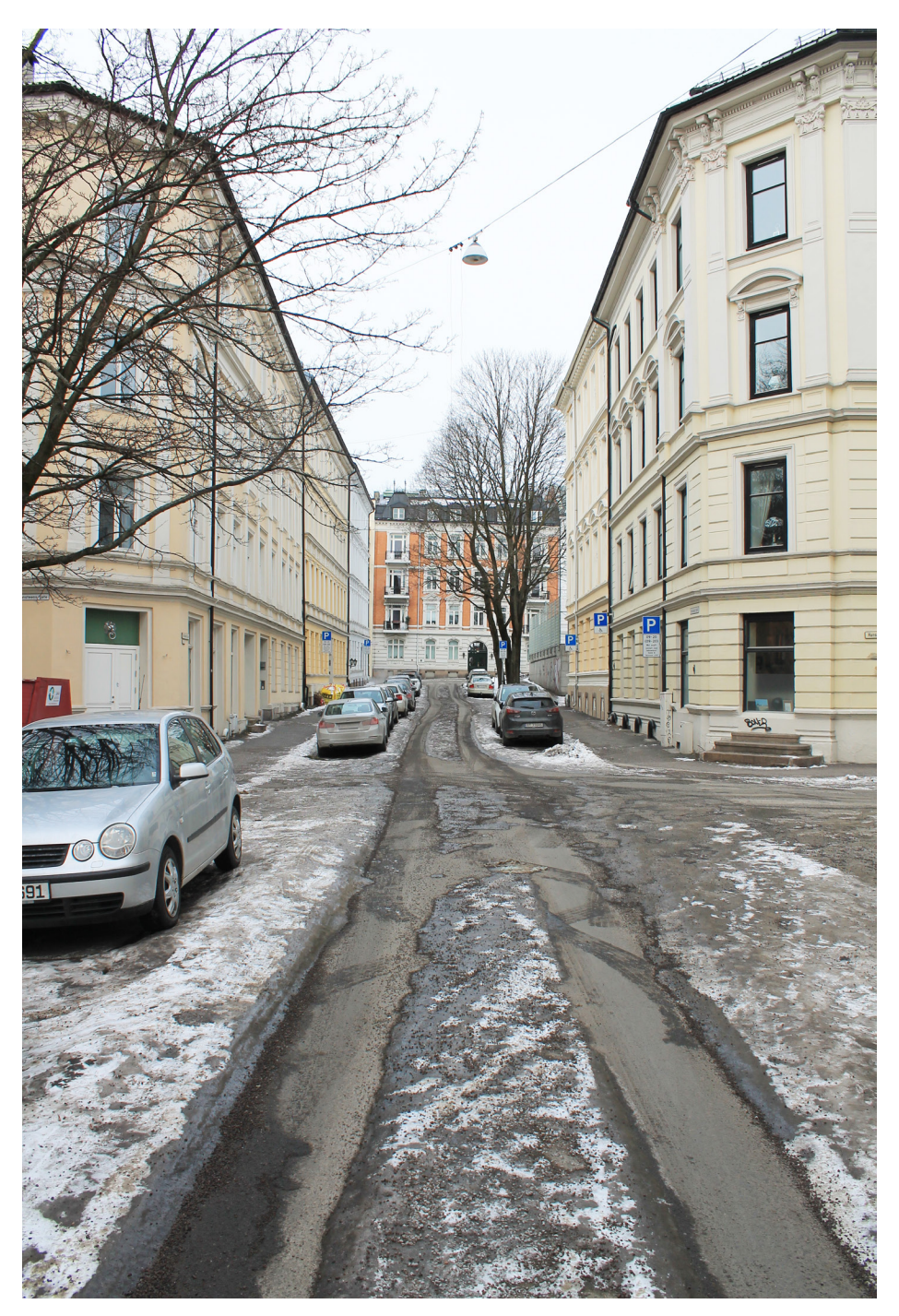
Standingin Reichweins gate looking north-west.