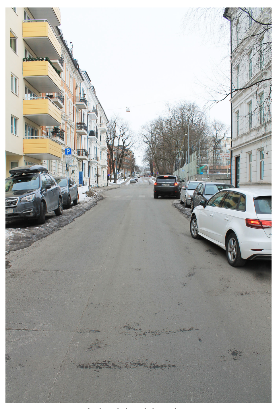
Standing in Parkveien, looking north-east.