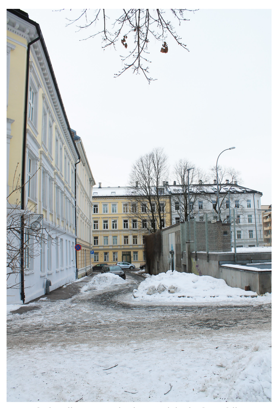
Standing in Observatoriegata in the pedestrian zone, looking down Børevens Løkke.