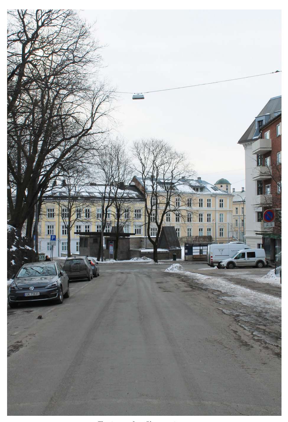
The site seen from Observatoriegata.