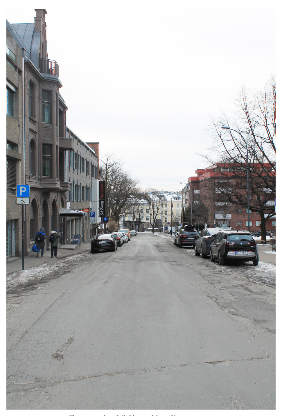
The site seen from Solli Plass and down Observatoriegata.