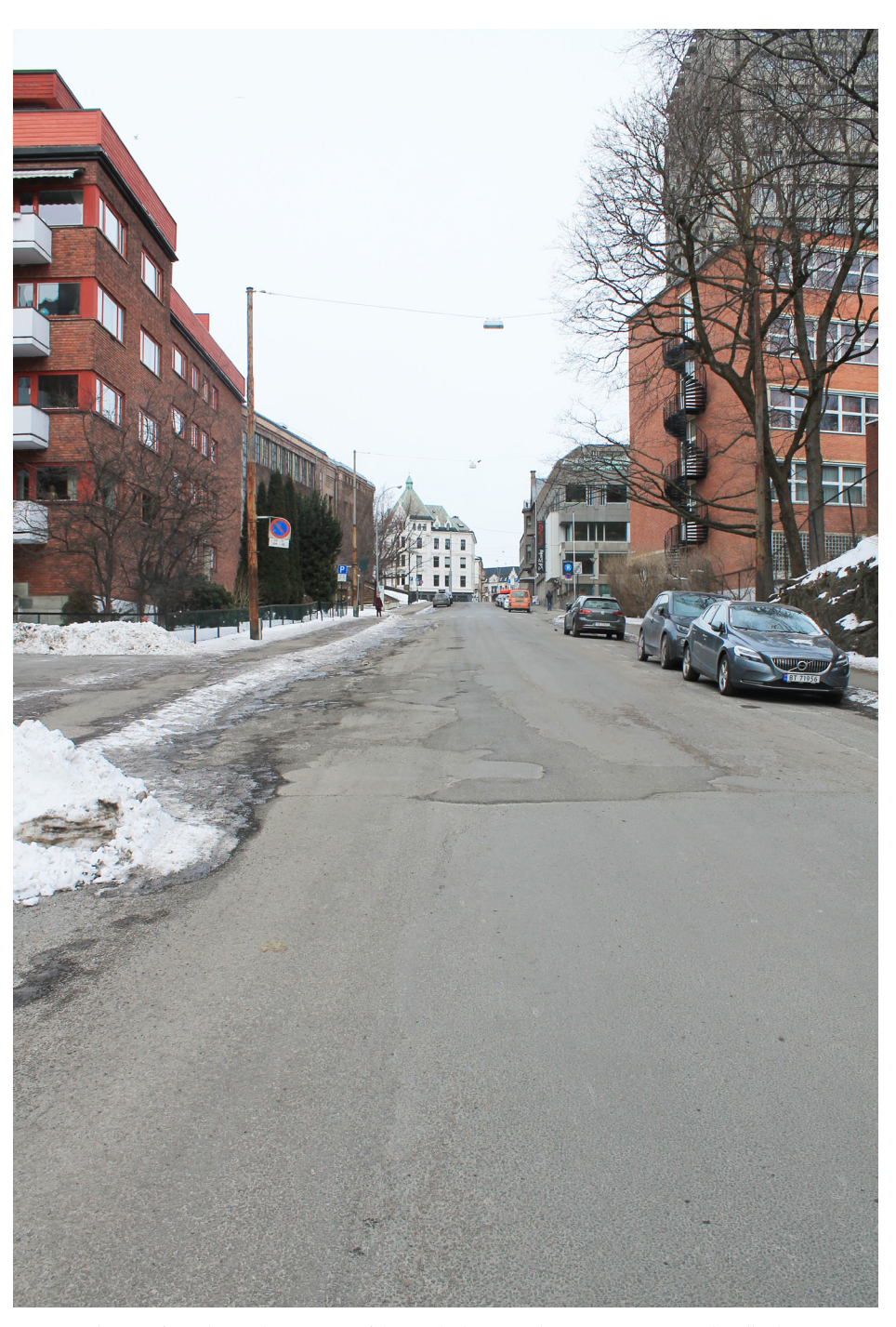
The view from the northern corner of the site, looking up Observatoriegata towards Solli Plass.