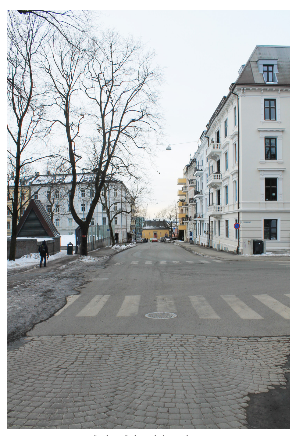
Standing in Parkveien, looking south-west.