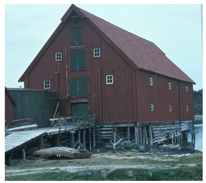
Old storage bulding at Kjerringøy

During the process it has been important for me to explore the relationship between autonomous external forms and internal space. How do the one inform the other, and what spaces can come out from designing a building from, so to say, starting in two opposite ends. Another factor has been important for me in order to honor at least one segment of local building tradition; namely pragmatism. This project has been created where uncompromising forms has met with the demands of a fairly straight forward program, mixed with some pragmatism from local building tradition, and it has become The School in the Isles. What did I want to achieve when I started? Presumably only to find out how the island school of tomorrow looks like, but the challenge has been both creative, structural, intellectual and technical. I hope something interesting came out of it at the end.