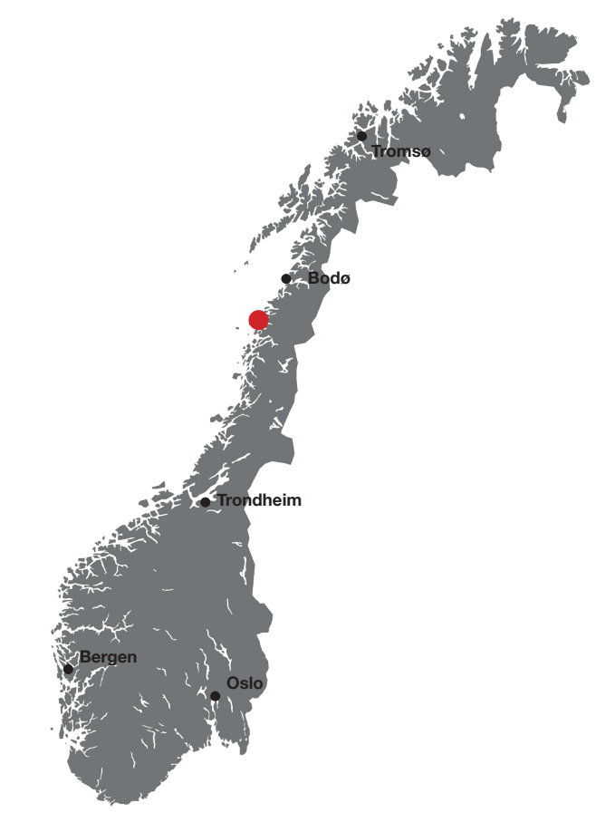
Rødøy Municipality is situated on the coast of Northern Norway.