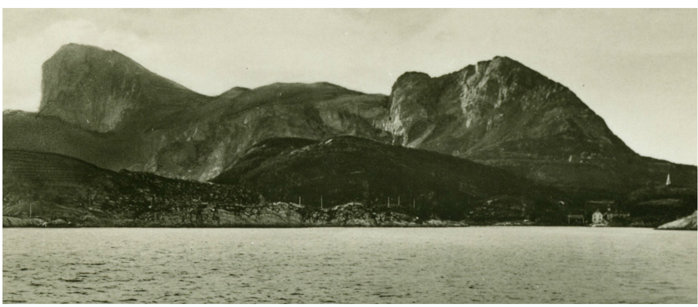
The island of Rødøy with different scales of objects. The mountain "Rødøyløva" (The Rødøy Lion) is visible from miles away and has been an important marker for sailors for centuries. It's also the motive of the municipalitie's coat of arms, a strong identity marker for the people of Rødøy. The white gable of a storage building leads the way to safe harbour and an important trading post. The church spire is visible from several miles away. It tells the story of the historical significance of this island.