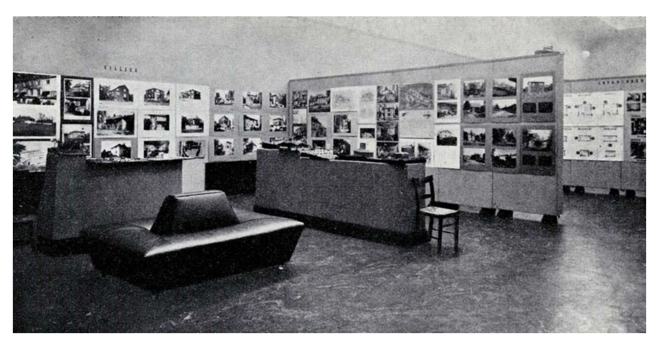
Fig. 9: The section for villas at the show at the House of Artists in Oslo in 1931 was installed in one of the two imposing sky-lit galleries.

'The art of exhibition is a branch of architecture and should be practiced as such', Philip Johnson famously declared in a review of Lilly Reich and Mies van der Rohe's installations at the Berliner Bauausstellung of 1931 (Johnson 1931). The Permanent Collection belongs to this branch of architecture, promoting the exhibits not just as means of representation but as projects in their own right. The fact that museums, galleries, and exhibition spaces formed an important part of the collection — for instance Ole Lind Schiestad's models and exhibition designs for the Norwegian pavilions in Barcelona in 1929 and Antwerp in 1930 were immediately incorporated into the collection