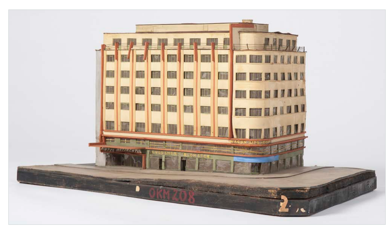
Fig. 3: Ole Øvergaard's Hotel Continental (1932) was originally conceived with vibrant colours, as shown in the model. The building is today 'restored' to a fictional modernism, in a dull, monochromic light grey.