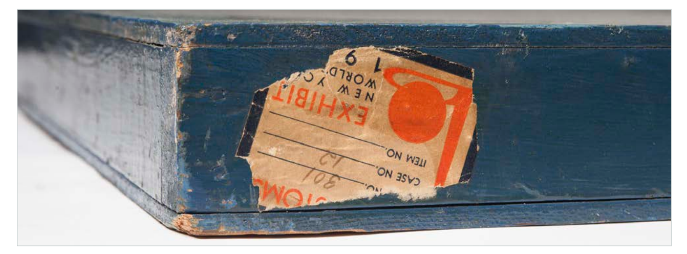
Fig. 2: A remnant of a sticker on the huge topographical model (1: 200, 70 x 301 cm) of Ole Lind Schiestad's Ingierstrand Bad (1934), confirms that the model was part of the collection as displayed in the Norwegian Pavilion at the World's Fair in New York in 1939.

The recovered parts of the collection immediately give an impression of its years en route. In addition to the small metal plates identifying forgotten model builders, the models are marked with various labels and different sets of numbers, tags, and stamps, hints of their changing