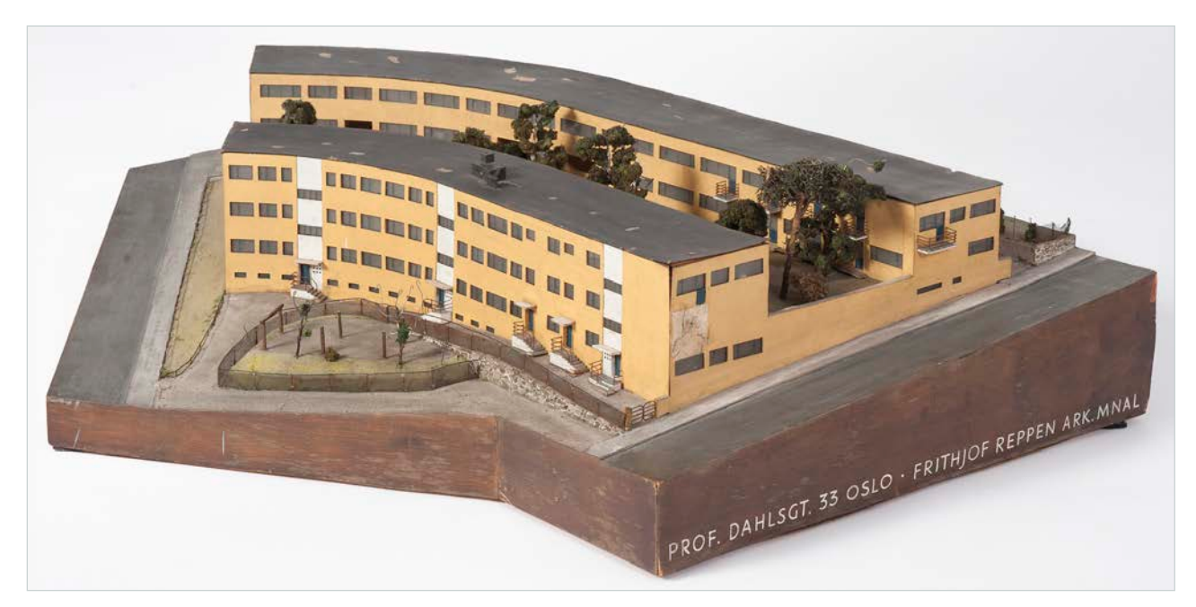
Fig. 7: The model of Frithjof Reppen's elegant Rowhouses in Professor Dahl's gate (1930) displays a situated modernism. The model sits on a wooden base, with facades in cardboard and paper, and with wire railings. The terrain is of painted papier-mâché, the grass in textile fibres, while wire covered with paper and lichen forms miniature trees.

members 'to seriously make note of the fact that the success of this endeavor — to create a permanent collection of exhibition material which will serve the architects' interests — depends on each member's concern and effort'. Eventually, a new deadline, May 1, 1926, was set for 'blueprints, amateur photographs or whatever else is at hand, as long as it is sufficient to judge the architectural merit of the work' ( Byggekunst 1926: 46). For the selection of works the same method was proposed as already established for the Houen's Prize — this and the Sundt Prize were and still are the most prestigious distinctions granted in Norwegian contemporary architecture — namely, that the local association would propose works to the NAL board, who would make the final decision.<sup>15</sup>