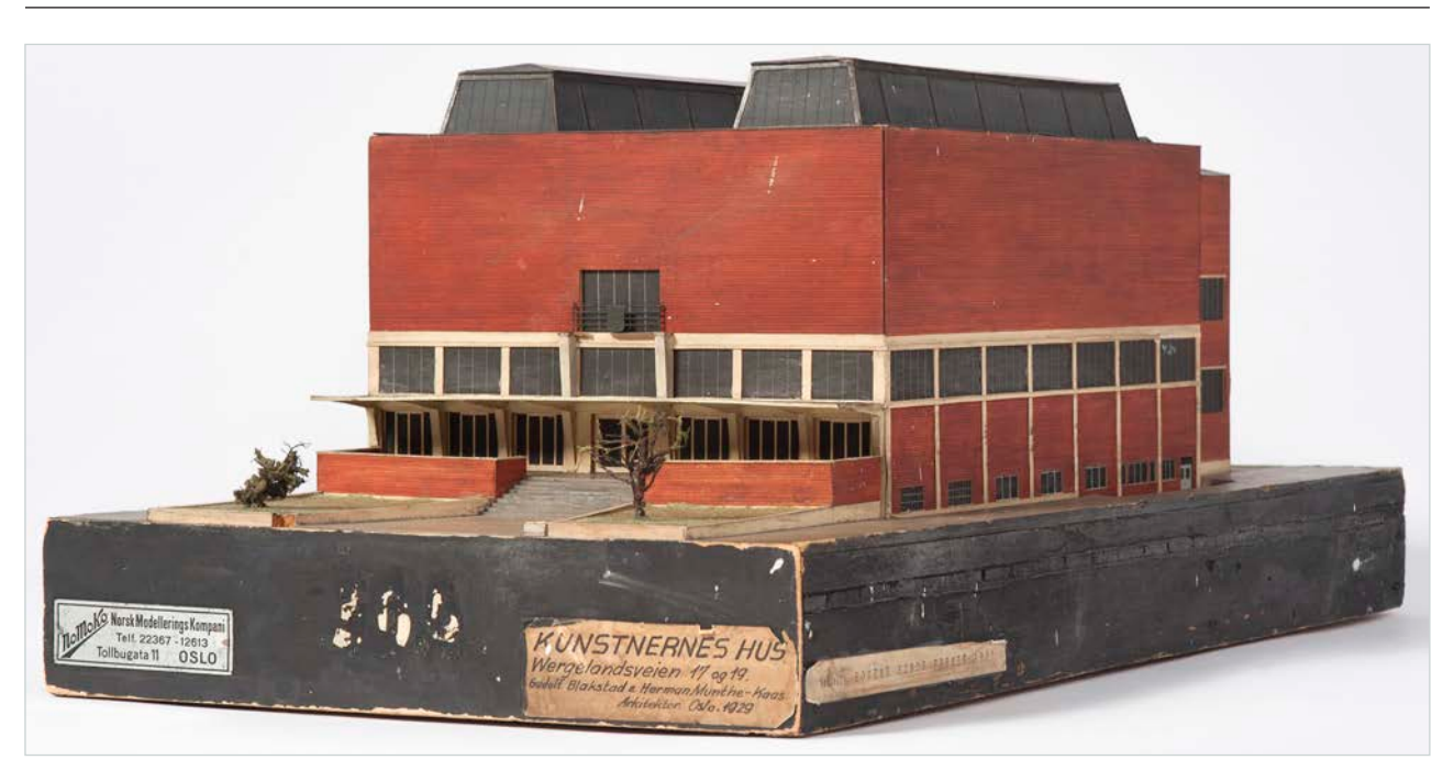
Fig. 1: In 1931, the audience of the grand architecture exhibition at the House of Artists in Oslo was mesmerized by the miniature of the new Kunsthalle. Designed by architects Blakstad & Munthe-Kaas and inaugurated in 1930, the building was at the time celebrated as the most modern exhibition space in Europe.

In November and December 2013, Mari Lending and Mari Hvattum salvaged parts of the Permanent Collection in the exhibition "Model as Ruin" at Kunstnernes Hus (House of Artists) in Oslo, the venue that hosted the most important display of the collection in 1931.