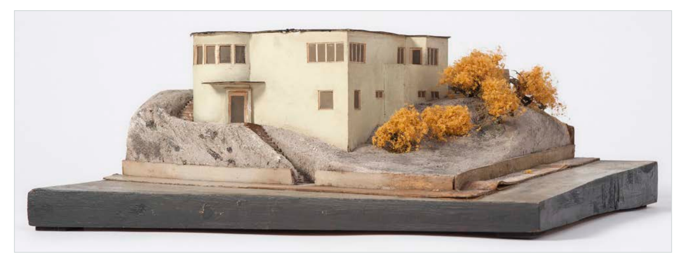
Fig. 4: With all the accessories of the international style – flat roof, corner windows, unadorned render façade – Ole Eindride Slaatto's lustrous Villa Figenschou (1932) meanders gently up irregular rock steps and steep slopes, as the model clearly shows. Slaatto's new work was continuously included in the collection; nevertheless, the production of this fine architect lingers on the outskirts of Norwegian historiography.

Fig. 3: Ole Øvergaard's Hotel Continental (1932) was originally conceived with vibrant colours, as shown in the model. The building is today 'restored' to a fictional modernism, in a dull, monochromic light grey.