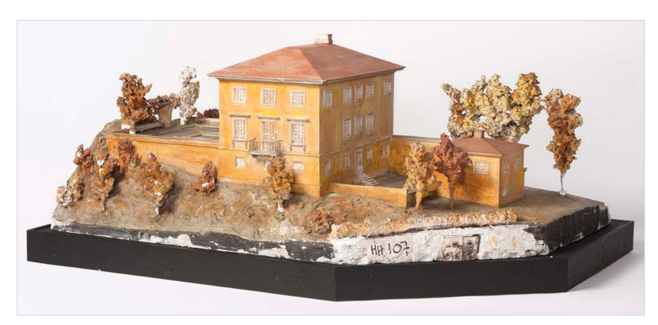
Fig. 6: The Permanent Collection displays an undogmatic modernism, and the ease with which Norwegian architects moved between a variety of different stylistic idioms in the 1920s. Lars Backer's sumptuously classical Villa Larsen (1924), here surrounded by huge deciduous trees made from natural sponge on metal wire, was completed as he was working on the Skansen restaurant in Oslo, an icon in Nordic modernism.