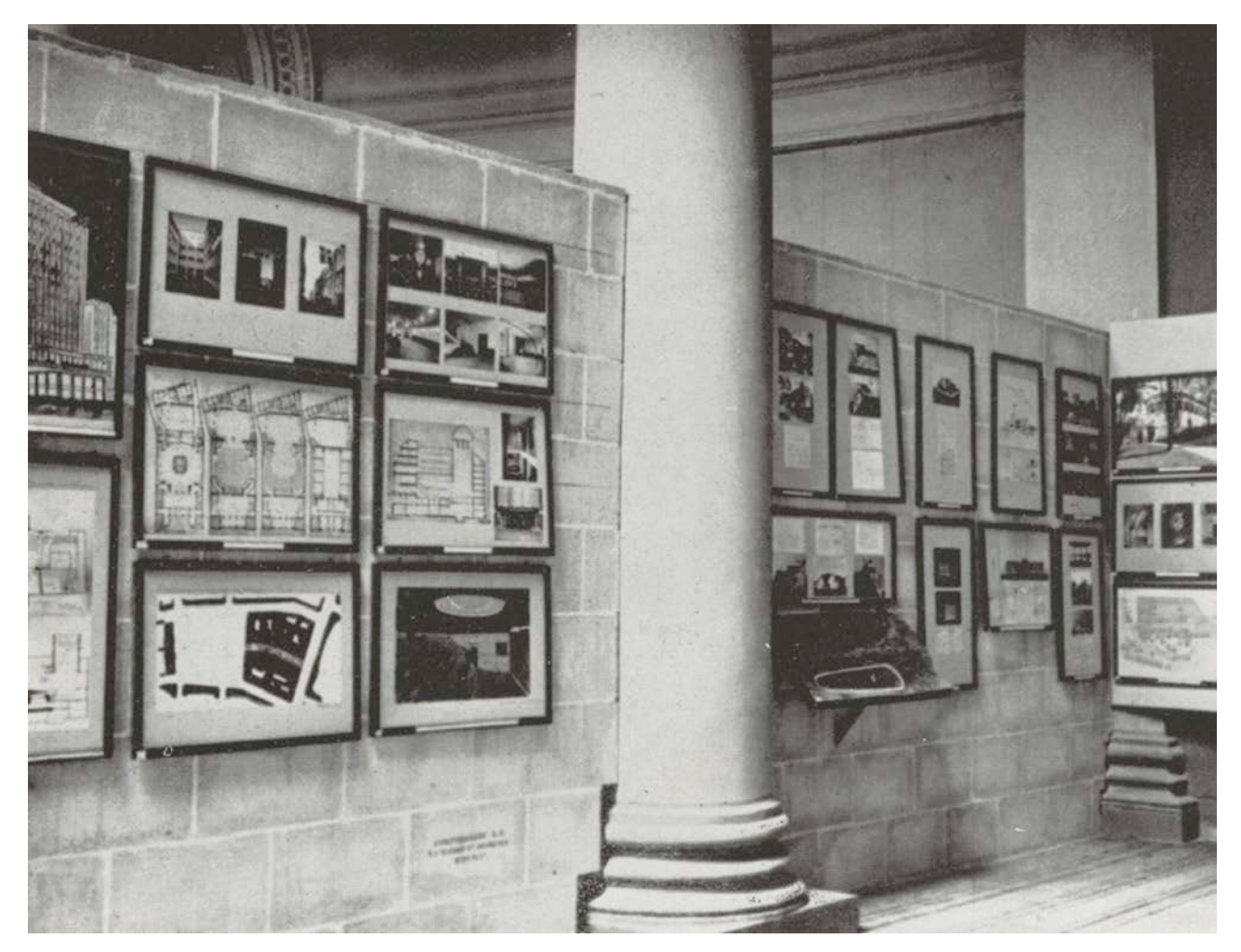
Fig. 8: The most permanent feature of the Permanent Collection was its ingenious mounting system, devised upon its founding in 1925. This photograph from the 1930 exhibition in Budapest shows the paper material framed, scaled, and mounted in accordance with the modular frieze, which proved to be adaptable to a variety of exhibition spaces. Reproduced from Compte-Rendu: Travaux du XIIe Congrès international des architectes (Budapest 1931).

Permanent Collection's module system. An almost complete inventory of the Budapest material has survived, with the mounting plans for drawings and photographs with given formats for heights and widths, a plan of the exhibition room, and six models.<sup>35</sup> Even though some of the work had already been exhibited, the comprehensive Norwegian section in the Budapest Palais des beaux-arts (131 items, outnumbered only by Hungary's 522 and Germany's 162) represented an essential update of models, photographs, and drawings, and increased the scope of architects involved in the collection.<sup>36</sup> During the preparations the OAF committee decided that the show planned in Oslo the next fall should be 'based on the material that these days is being shipped to Budapest'.<sup>37</sup> However, for Budapest 'the architecture most characteristic for Norway has been selected, something which is really not necessary in Oslo': 'New projects will also appear by then'. This illustrates the contemporaneity of the Permanent Collection, but also its versatility in changing contexts.