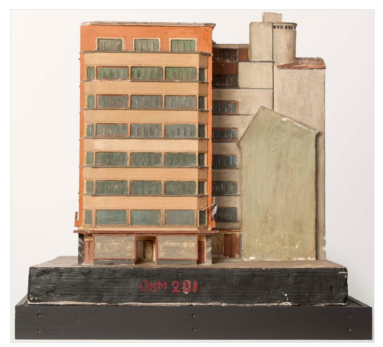
Fig. 10: Lars Backer's mini skyscraper Horngården (1930) became one of the stars in the Permanent Collection and was shown repeatedly. Due to damages incurred during shipping, it was restored once and once completely rebuilt. Thus this model of painted plaster on a wood and steel support structure, and with steel elements on the façade, is the second version of the model in the collection. Photo: Andreas Svenning, 2013.

The Permanent Collection's principle of absolute contemporaneity, an idea that substantially challenges the inherent psychology of both collectors and collections was in the end not very successful. Despite the idealistic resolve to exclude outdated projects, the collection grew