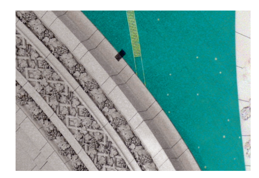
4 Beyer Blinder Belle Architects, rectangular field of soiling on the ceiling of the main hall of Grand Central Station in New York City (Warren and Wetmore, 1929), produced during the restoration and cleaning of the building between 1987 and 1997.

The precise date when current preservation aesthetics would cease to make sense could not be foretold, but reversibility anticipates it as a given in the temporal mode of the future anterior. The belief, inherent in the theory of reversibility, that preservation's aesthetic expressions will have been effaced, is also a wish for the eventual replacement of our contemporary cultural understanding of monuments by a more or less advanced one. This peculiar sense of preservation as aesthetic expressions of the future anterior has become the enabling element for a new conception of monuments as objects whose cultural use is not only that of elucidating the past but also that of visualizing the future and horizon of contemporary culture.