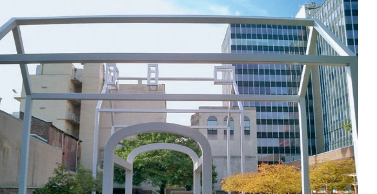
2 Venturi and Rauch, Restoration of Benjamin Franklin's House (background) and Printing Press (foreground), Philadelphia, 1976.

8 Franco Minissi, Conservazione dei beni storico artistici e ambientali. Restauro e musealizzazione, Rome, 1978.