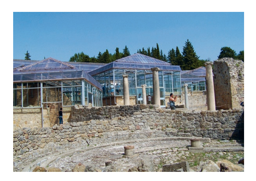
3 Protective structures designed by Franco Minissi in 1957 over the foundations and mosaic floors of the Casale villa (4th century CE) in Piazza Armenina, Sicily.