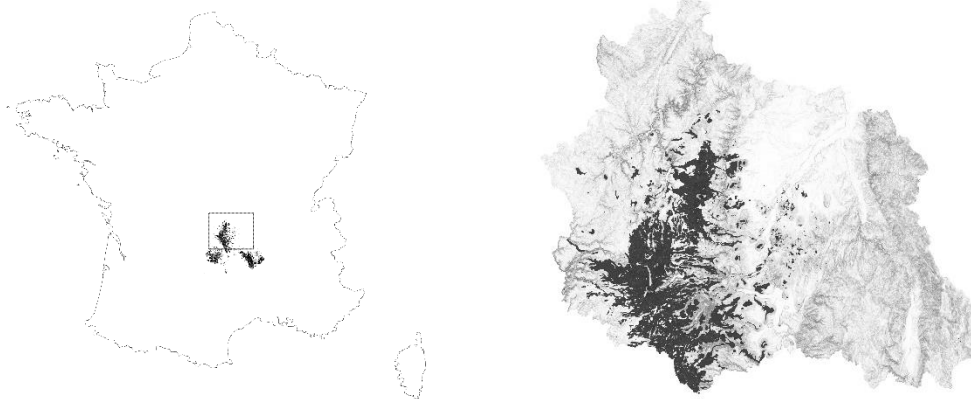
Figure.1 Volcanism's location in France

Clermont-Ferrand is settled within a particular volcanic setting. Volcanism in metropolitan France is a unique phenomenon and feature located in central France, in the Auvergne region. The Chaîne des Puys – UNESCO site since 2018 – is seen as a valuable green resource and territorial identity for the local population.