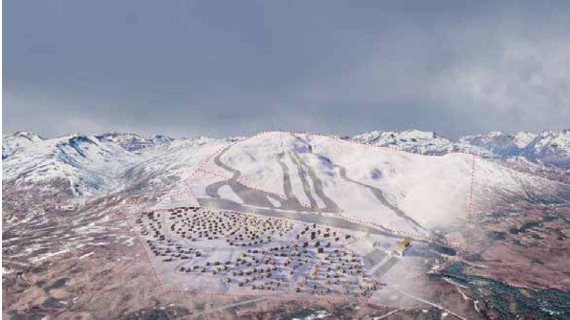
Extent of Arctic Center.

This diploma project will be a research based design, which investigates ways of looking closer to the landscape with keeping all the complex layers a place can hold, equally in mind. In this case a site was chosen, where since many years there is a debate about building a huge tourist structure, called the Arctic Center, on a already very rich, but also vulnerable landscape. This project does not show any sensibility to the site itself at all.