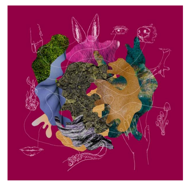
Figure 3: Connecting the senses of more-than-human species to stimulate pleasurable fertility sensing through touching, tasting, seeing, and listening.

For this, design needs to work beyond the normative body, adopting intersectional feminist positionalities, considering how gender, race, class, ability, and sexuality have determined who gets to have pleasurable experiences. Furthermore, despite finding ourselves in an anthropocentric position we might not be able to fully avoid, designing for fertility could look beyond human exceptionalism and attend to more-than-human needs and experiences, who are also deserving of pleasure. For example, in how Ece Tan (2022) explores how to design for cows' dignity and pleasure during artificial insemination, or how artists and philosophers Annie Sprinkle and Beth Stephens explore what it means to become lover with the Earth in their ecosexual positionality (Sprinkle et al., 2021).