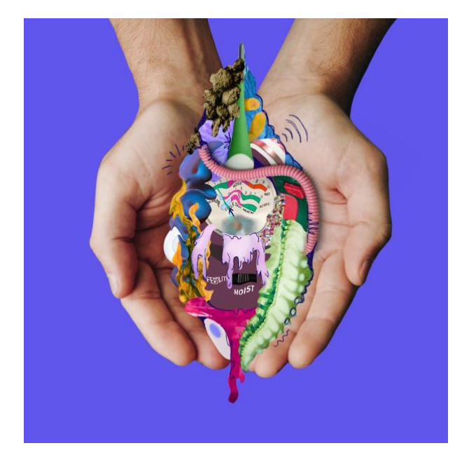
Figure 2: The morphing of shapes, colors, and materials of human-animal-soil fertility sensors suggest a new soft norm-critical aesthetics.

For this design seed, we offer an opportunity to rethink the aesthetics of fertility. Might we move from harsh shapes, forms, and materials, to softer, less medical, and industrial choices? And how might we avoid conforming to gendered stereotypes through these aesthetic choices, moving towards norm-critical aesthetics of fertility sensing (Ehrnberger et al., 2012)?