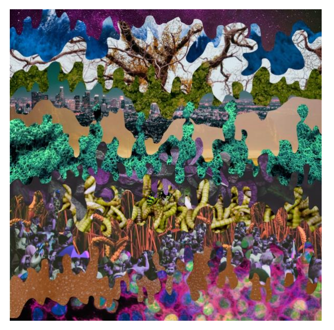
Figure 4: Like layers in soil, micro to macro, fertilities bleed and leak from individual concerns to collective responsibilities, to planetary care.

T: In this design seed, we ask: how can we invite others into fertility? How can we expand the responsibility and care of fertility from individual to collective to planetary? How can we design for one fertility in a way that prospers and cares for other species' fertility? And how can we do this by maintaining bodily autonomy and acknowledging that not all fertile bodies (have) receive(d) the same reproductive rights?